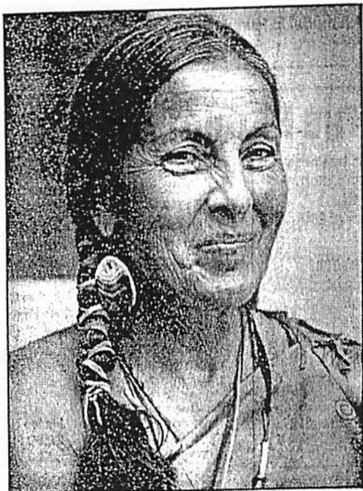
Dove is one of a group of women who act out episodes from Wampanoag and Quaker history.